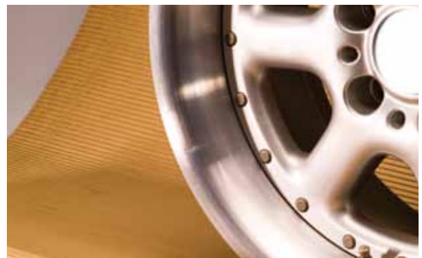
Well protected by corrugated board packaging with VCI treatment