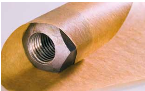
Perfectly wrapped individual parts, ideal for the engineering

Whatever your packaging requirements we have the VCI product for you!