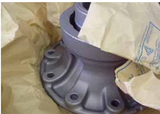
Goods after transport with VCI protection