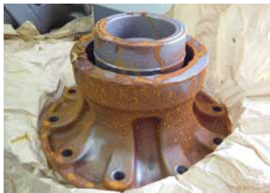
Goods after transport without VCI protection