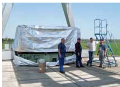
Packaging stage 2