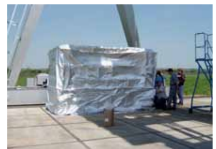
Packaging stage 3