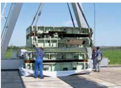
Packaging stage 1