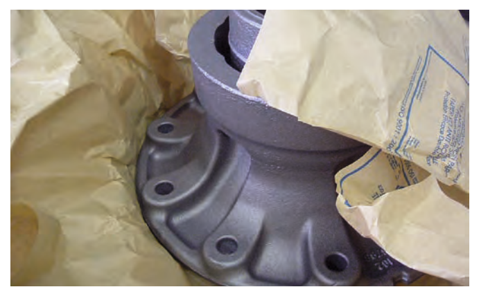
Goods after transport with VCI protection