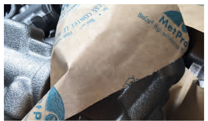
Well protected with BioCor® VCI Paper