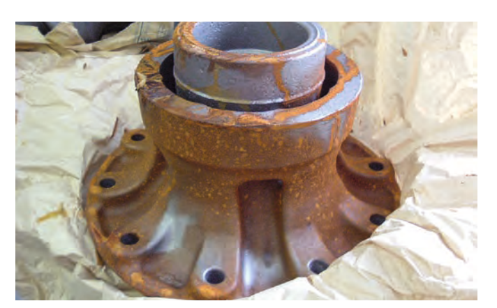
Goods after transport without VCI protection